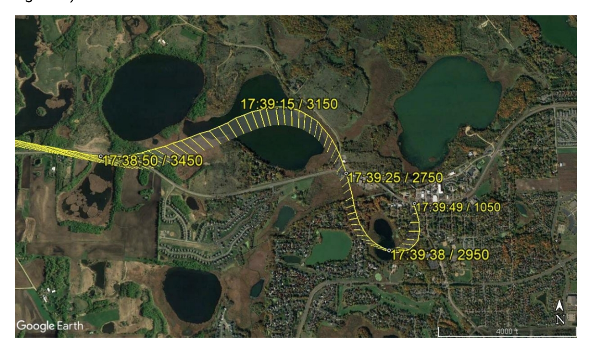
Figure 3. Flightpath showing increasingly tight turns with times and altitudes (in msl).

The NTSB conducted a performance study for this accident based on ADS-B data. The study found that, after 1739:00, the airplane made increasingly tight turns at speeds above V_A (see figure 3).