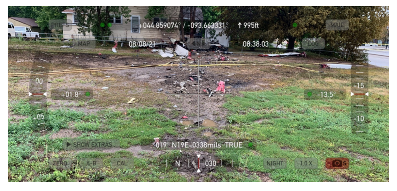
Figure 2. Airplane at accident site with parametric data overlaid.

The airplane impacted the ground on a northerly heading (see figure 2). The left horizontal stabilizer and left elevator were found about 720 and 800 ft southwest of the accident site, respectively. A 6-inch section of the main wing spar upper cap splice plate was found about 300 ft southwest of the accident site.