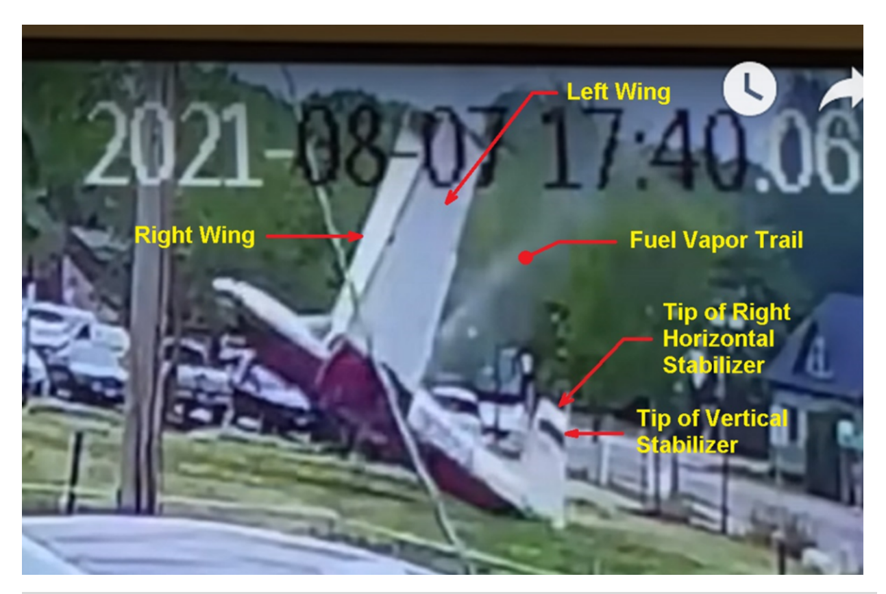
Figure 1. Screen capture of airplane just before impact (Source: doorbell security video).